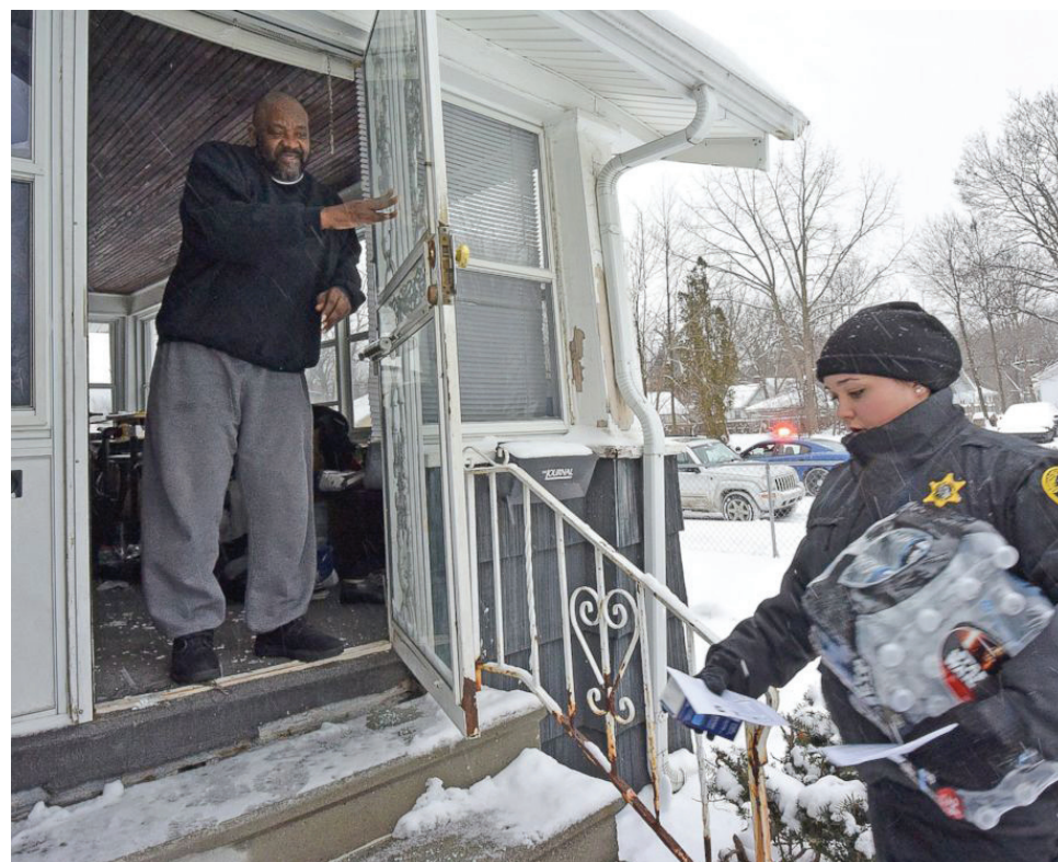
Michigan State Police and Genesee County Sheriff's Deputies bring residents water filters and bottled water on Jan 12, 2016.

Source: http://philanthropynewsdigest.org